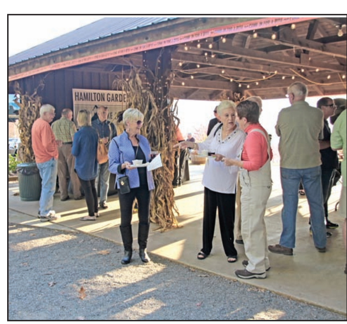
More than 175 people attended the successful "Spooktacular Evening in the Gardens" on Saturday, Oct. 29, hosted by Hamilton Gardens at Lake Chatuge.