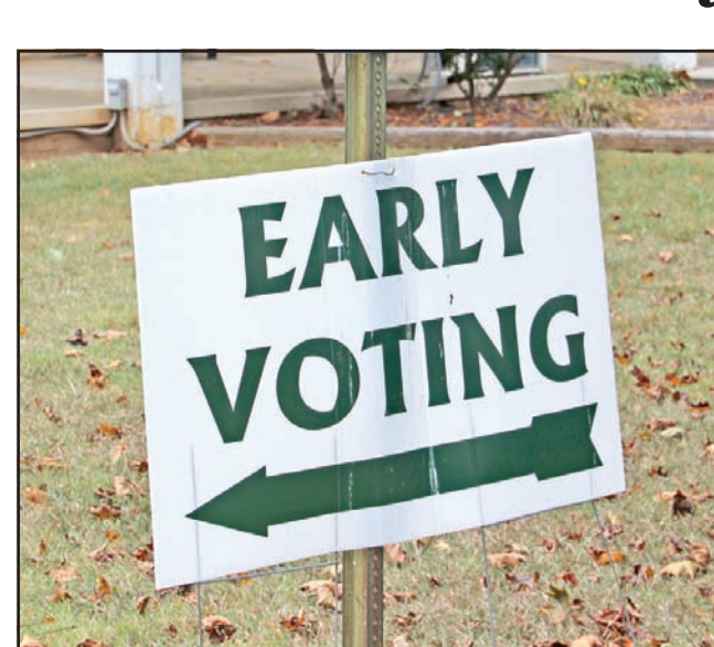
This sign hangs across from the Old Rock Jail, clearly pointing the way for would-be early voters.

Nov. 8 Election Day voting will not occur at the board of elections office. On Election Day, between 7 a.m. and 7 p.m., voters will need to vote at their assigned voting precincts, of which there are four: Hiawassee, Young Harris, Macedonia and