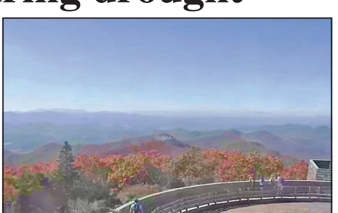
Here is a view of the Chimneytop wildfire from Brasstown Bald's southern webcam. Smoke from the fire can be seen billowing leftward in the middle of the picture.

Since then, 95 percent of the fire has been contained by a control line. The remaining